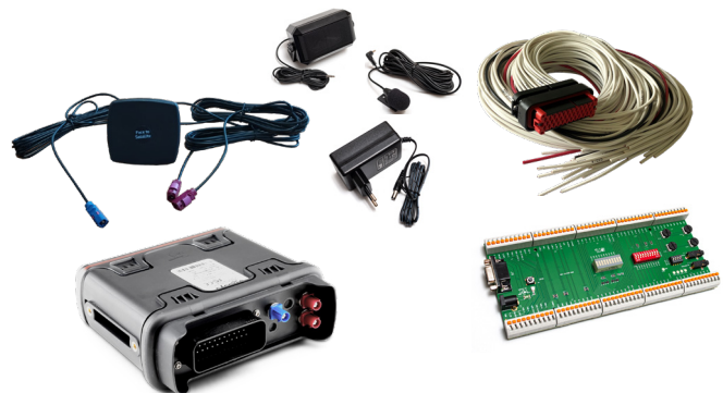
(owa4X gateway not included)